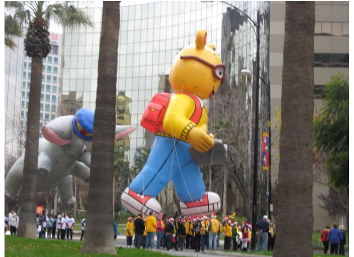
San Jose Christmas Parade 12/2009 All of those in yellow jackets are Lions!