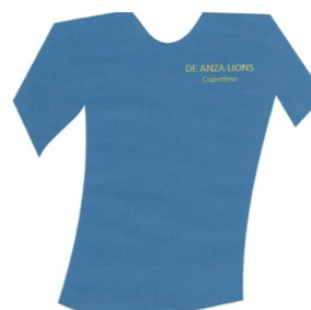
Color Darker than shown.

Opportunity to purchase a Tee Shirt for $20.00, with no logos so it may be worn by non-Lions. Suggest it can be worn by De Anza Lions, family, friends and volunteers. Quality is DT 6000 Cotton. Male sizes are small, medium, large, X large and XXlarge.