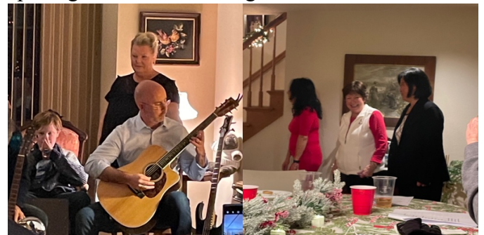
Blue Bells and dancers—just a sampling of what went on during the party.