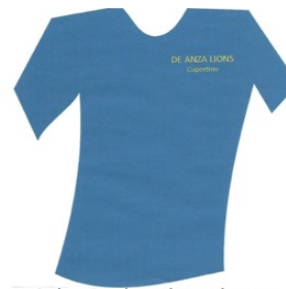
Color Darker than shown.

Opportunity to purchase a Tee Shirt for $20.00, with no logos so it may be worn by non-Lions. Suggest it can be worn by De Anza Lions, family, friends and volunteers. Quality is DT 6000 Cotton. Male sizes are small, medium, large, X large and XXlarge.