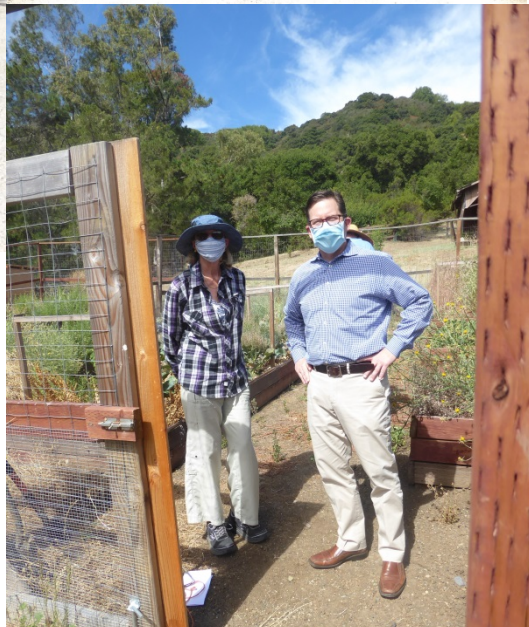
The Volunteers & VIA staff