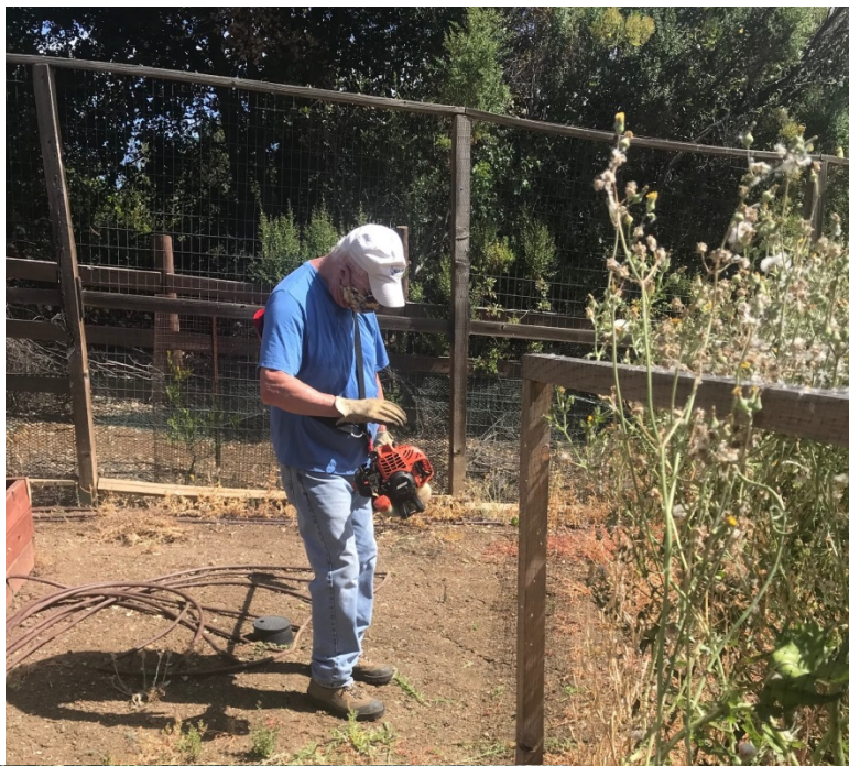
The wild Gardens – overgrown with weeds