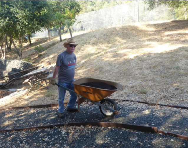
People at Work